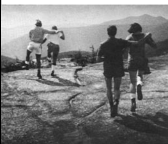
Return to Moosilauke!